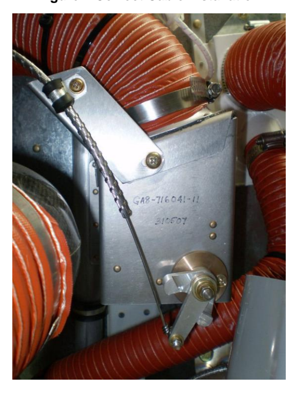
Figure 2 Incorrect Cable Installation