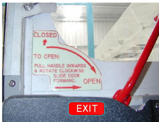
Figure 3 – Internal Placard on Rear Door