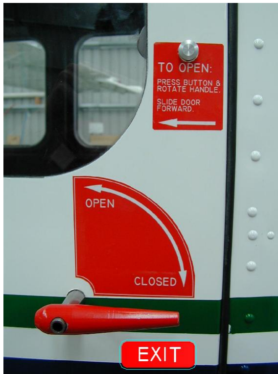
Figure 2 – External Placard on Rear Door